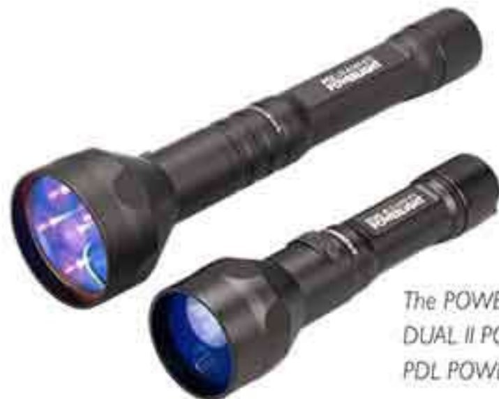
The POWERLIGHT serie: DUAL II POWERLIGHT PDL POWERLIGHT